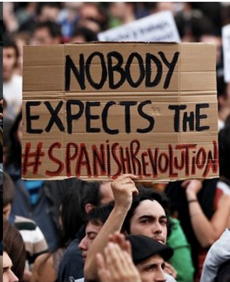
Plaza del Sol, Madrid May 15, 2011