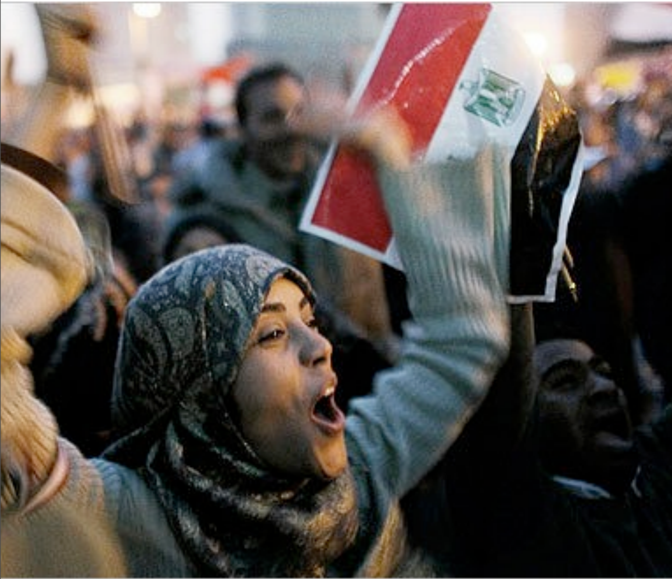
Tahrir Square, January 2011