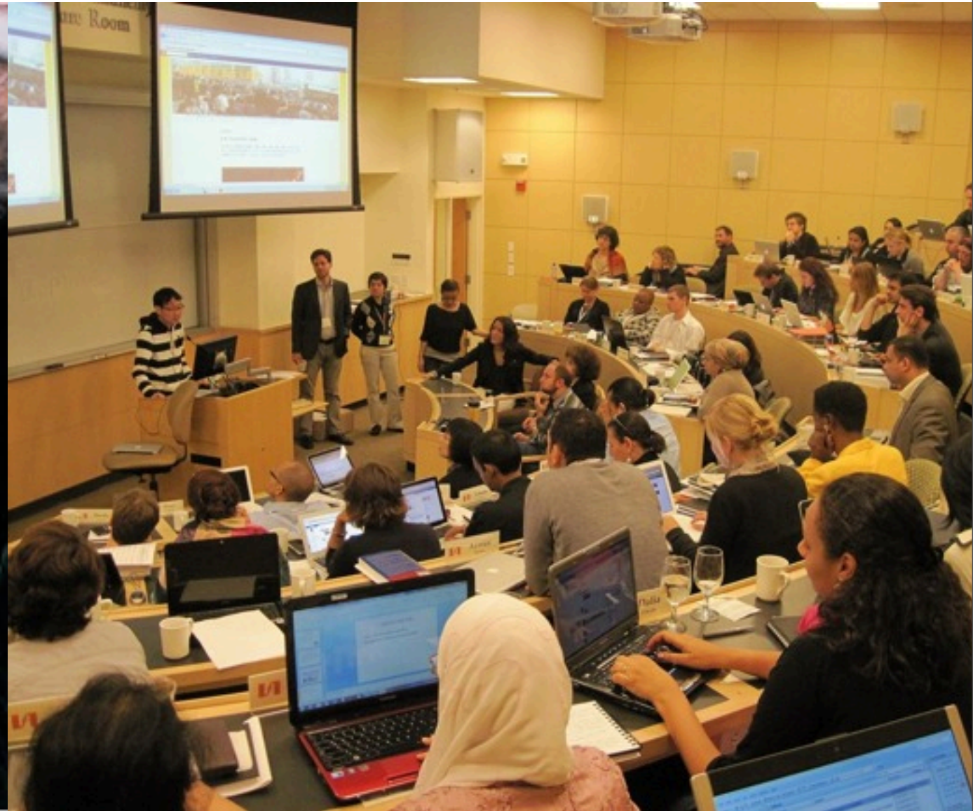
Fletcher Summer Institute, June 2011