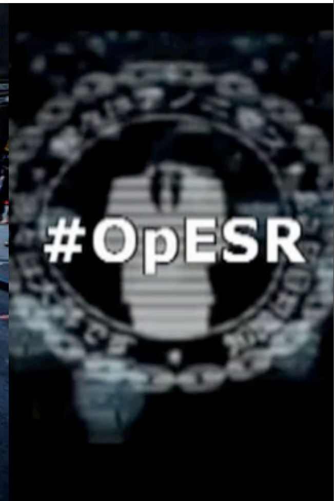
March on Wall Street May 12, 2011