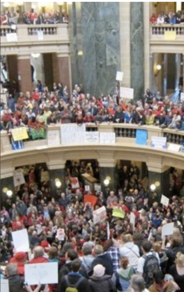
Madison, Wisconsin, February 2011