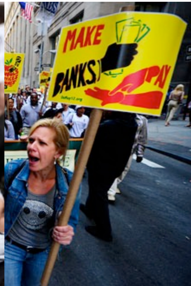
Anonymous A99 June 14, 2011