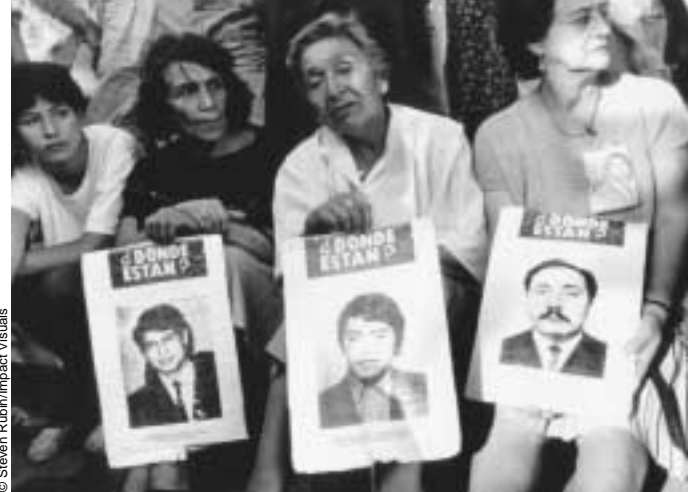
Family members of the “disappeared” at a human rights rally in Chile, December 1988

The hub of the great strike that rocked Poland in August 1980 was a conference room in the enormous Lenin Shipyard in Gdansk. There, delegates elected by workers from each of the striking factories of the region formed an Interfactory Strike Committee to coordinate the strike as it spread along the Baltic Coast. In almost