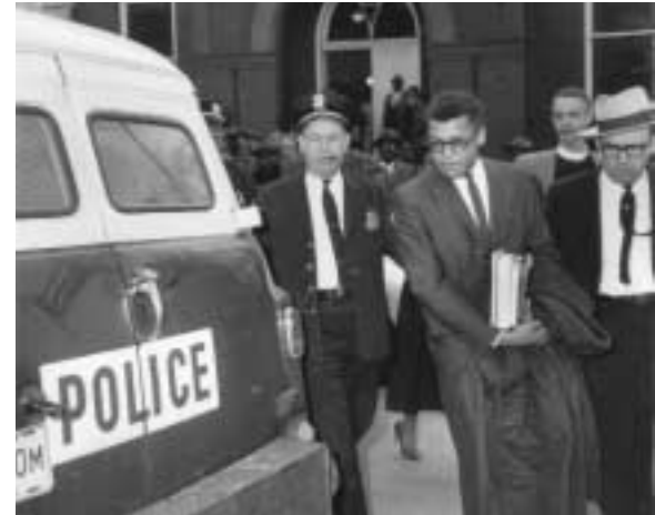
Rev. James Lawson being led to a police wagon, March 1960

The students’ nonviolent discipline accomplished even more. The violence sparked outrage among the broader black community in the city. Soon almost all of black Nashville was boycotting the downtown stores, adding the economic power of consumers to the voices of the demonstrators and thereby winning strategic victory.