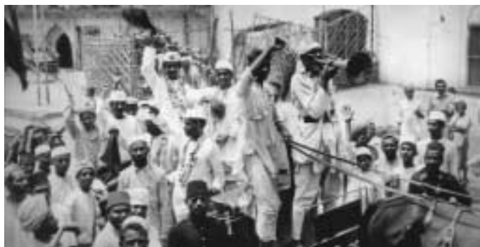
Demonstrators march in Delhi against importation of foreign cloth, 1922

But the British showed few signs of bending, and Gandhi turned to more aggressive forms of nonviolent action. He knew the British were vulnerable: they depended on those they ruled. Governments cannot govern if ordinary