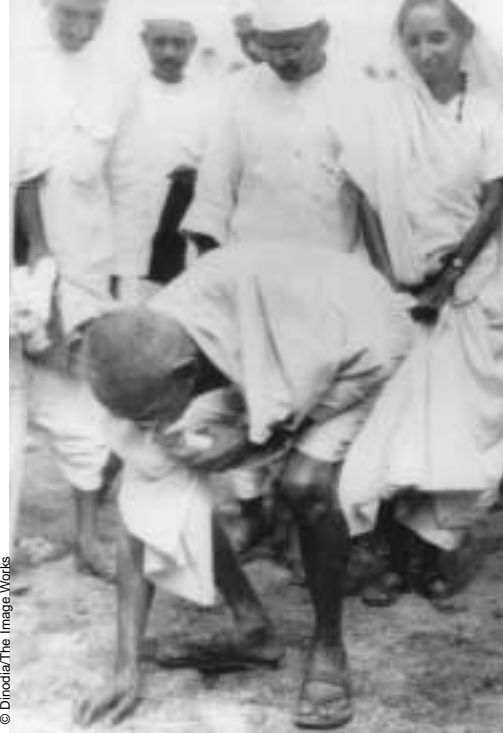
Gandhi gathers salt on his march in India, 1930

The students who participated in the lunch counter sit-ins, which began in early 1960, were a small and disciplined corps of activists. They did not flinch when they learned, after the first few sit-ins, that Nashville's