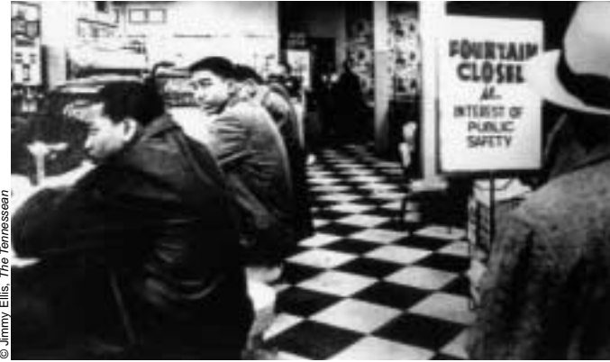
Sit-in at Walgreen’s lunch counter in Nashville, February 1960

Mobilizing and sustaining a popular movement geared to nonviolent action go hand in hand with forming a civil society and sustaining democracy.