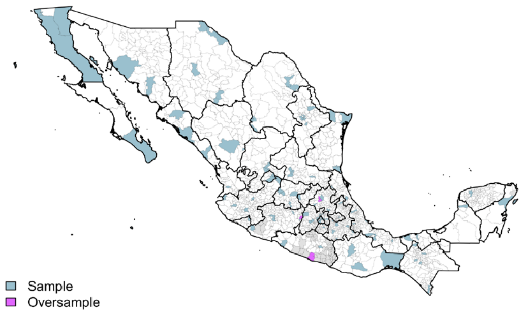
Figure 2: Survey Sample Distribution

The distribution of the sample is shown below in Figure 2. In addition to the national sample (shown in blue) there is an oversample of civilians living in geographic proximity to communities with armed self-defense groups ( grupos de autodefensa ). The sample size of this oversample is 300 valid interviews and has an estimated margin of error of +/- 5.7% at 95% confidence level. The oversample was conducted within the states of Guerrero, Michoácan, and Hidalgo.