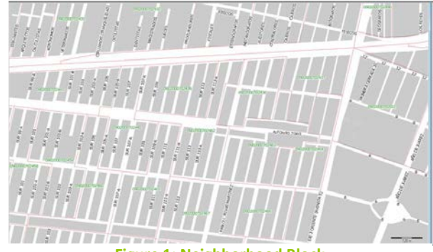
Figure 1: Neighborhood Block

Within each PSU, neighborhood blocks were enumerated. A map of one of these neighborhood blocks is shown in Figure 1. After enumeration, two blocks were randomly selected using a simple random selection procedure. These constitute the Secondary Sample Units (SSU). In each SSU, a total of five interviews were conducted. The five households were selected using a systematic skip pattern with a random start and according to household density in each SSU. These constitute the Tertiary Sample Units (TSU).