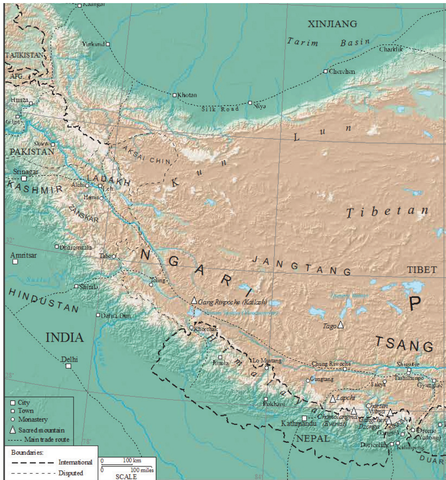
Figure 3. Map of Tibetan Plateau with International and Disputed Boundaries

A high-resolution version of this map can be downloaded at: http://treasuryoflives.org/maps/uploads/main_map/main_map.pdf .