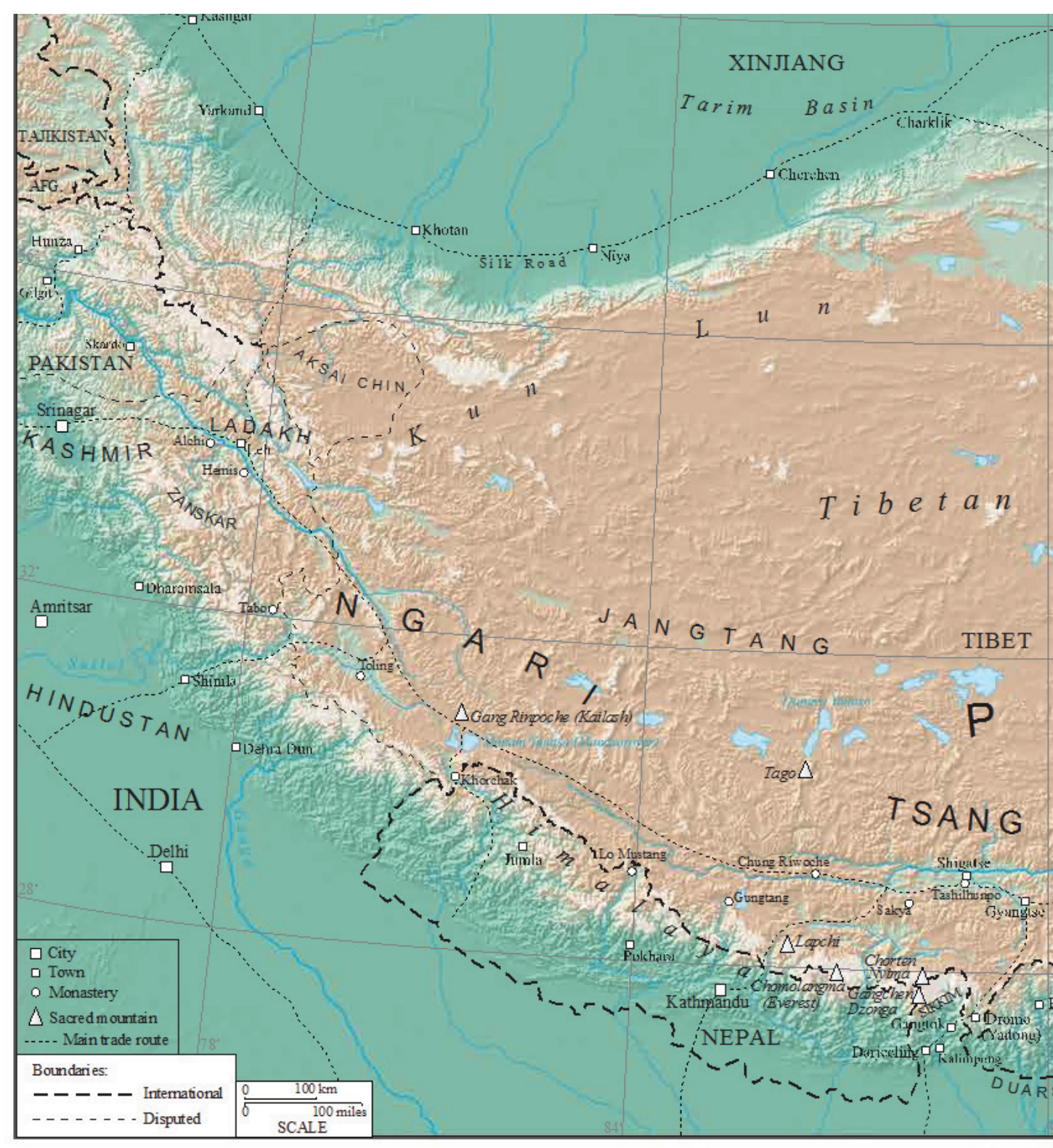
A high-resolution version of this map can be downloaded at: http://treasuryoflives.org/maps/uploads/ main_map/main_map.pdf.