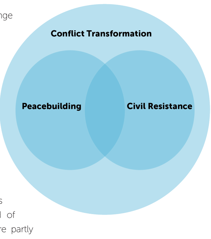
Figure 1: Civil resistance and peacebuilding as sub-components of conflict transformation

Peacebuilding theory and practice encompasses quite a diverse range of approaches, some of which are quite distinct from civil resistance, while others are conceptually, normatively or strategically aligned with the ethos and practice of nonviolent struggles. Figure 1 depicts these two approaches as sub-elements of the larger field of conflict transformation, which are partly overlapping, partly divergent.