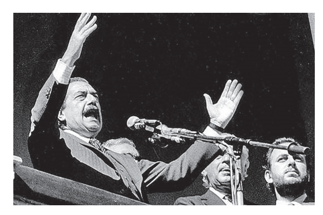
Raúl Alfonsín announces the end of the mutiny.

President Alfonsín, who had largely been in the background during this period, then became more pro-active, encouraging mass actions and lining up leaders of every major political party, along with leaders of civic organizations, business groups, the Catholic Church, and labor unions to sign a document pledging to "support in all ways possible the constitution, the normal development of the institutions of government and