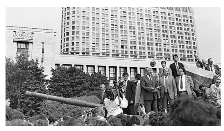
Boris Yeltsin, President of the Russian Federation at the moment of the Soviet Union's dissolution, addressing the crowd from atop a tank near the Council of Ministers building on August 19, 1991.

In response, tens thousands of people spontaneously gathered the streets of Moscow opposition to the coup. In a widely circulated image, Russian Federation President Boris Yeltsin climbed on top of a putschist tank and denounced what he called a "rightist, reactionary, anti-constitutional coup." Declaring "all decisions