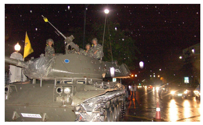
In 2006, the Thai army orchestrated a coup that overthrew Prime Minister Thaksin Shinawatra while he was out of the country.

of hundreds of thousands of demonstrators. On May 14, various opposition groups formed the Confederation for Democracy, which expanded the campaign from a largely middle-class effort to one including the working class and slum dwellers. By the third week of May, over a half million people had gathered in Bangkok and attempted to seize the Government House. Though the protests remained