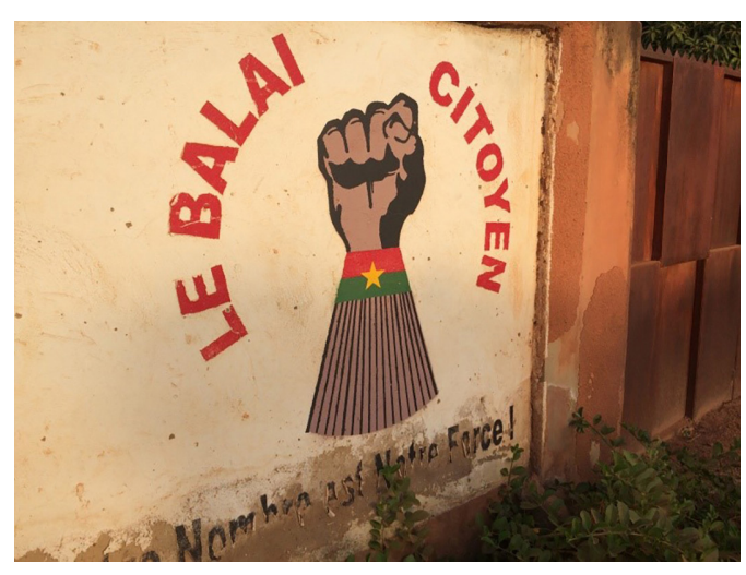
Le Balai Citoyen headquarters in Ouagadougou, Burkina Faso.

A grassroots left-leaning movement known as Le Balai Citoyen, (literally meaning "the citizens' broom" or a citizen-led movement for sweeping change), which had played a major role in the 2014 uprising, immediately called upon the people of Ouagadougou to gather in Revolution Square outside the presidential palace to protest the coup ( Le Monde Afrique ). As hundreds of protesters assembled, shouting "Down with