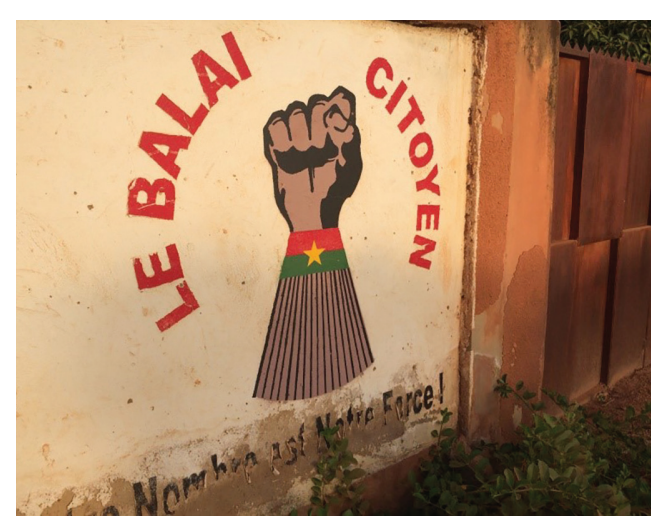
Le Balai Citoyen headquarters in Ouagadougou, Burkina Faso.

Α grassroots left-leaning movement known as Le Balai Citoyen, (literally meaning "the broom" or a citizen-led movement for sweeping change), which had played a major role in the 2014 uprising, immediately called upon the people of Ouagadougou to gather in Revolution Square outside the presidential palace to protest the coup (Le Monde Afrique). As hundreds of protesters assembled, shouting "Down with the RSP!" and "We want elections!",