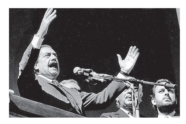
Raúl Alfonsín announces the end of the mutiny.

President Alfonsín, who had largely been in the background during this period, then became more pro-active, encouraging mass actions and lining up leaders of every major political party, along with leaders of civic organizations, business groups, the Catholic Church, and labor unions to sign a document pledging to "support in all ways possible the constitution, the normal development of the institutions of government and