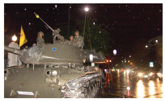
In 2006, the Thai army orchestrated a coup that overthrew Prime Minister Thaksin Shinawatra while he was out of the country.

of hundreds of thousands of demonstrators (see Table 2 on page 29). On May 14, various opposition groups formed the Confederation for Democracy, which expanded the campaign from a largely middle-class effort to one including the working class and slum dwellers. By the third week of May, over a half million people had gathered in Bangkok and attempted to seize the Government House. Though the