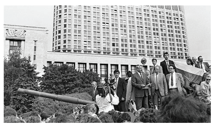
Boris Yeltsin, President of the Russian Federation at the moment of the Soviet Union's dissolution, addressing the crowd atop a tank near the Council of Ministers building on Aug. 19, 1991.

ln response, tens thousands of of people spontaneously gathered in the streets of Moscow in opposition to the coup (see Table 1 on page 26). In a widely circulated image, Federation President Russian Boris Yeltsin climbed on top of a putschist tank and denounced what he called a "rightist, reactionary, anti-constitutional coup." Declaring "all decisions